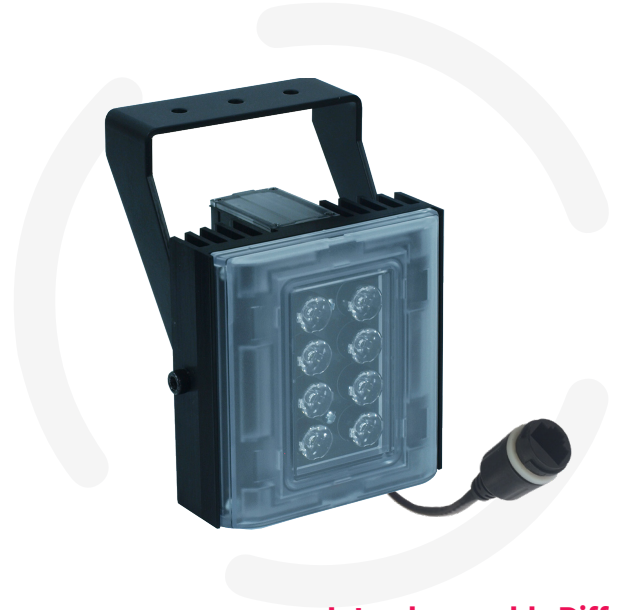
Interchangeable Diffuser Lens